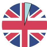
Percentage of available plant-based meat products containing fortification in the UK (2021) Sweden (2022) and the Netherlands (2023)

Producers may be reluctant to pay more to fortify if it results in a less desirable consumer product, so rates of fortification in plant-based meat vary significantly by country. Studies suggested rates in the UK (2021) and Sweden (2022) were significantly lower than the Netherlands (2023) where plant-based meat meeting certain nutrition criteria (including fortification) is endorsed by their National Nutrition Centre .